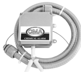
Low Chemical Alarm