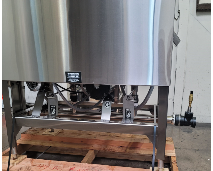
2. Attached to right side of Drain Manifold