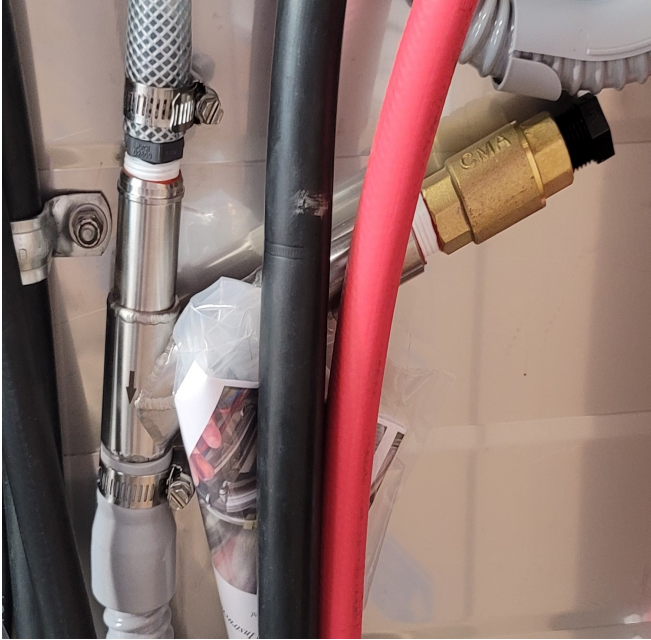
1. DWT with black plug installed