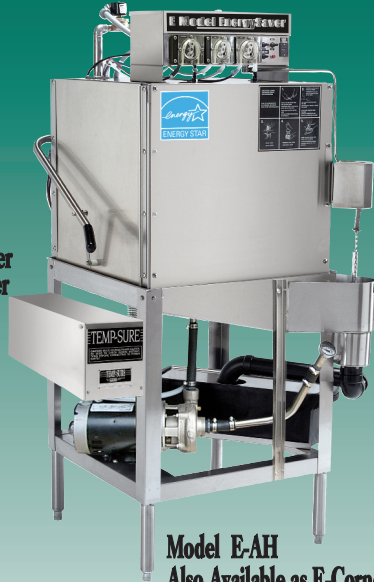
Model E-AH Also Available as E-Corner