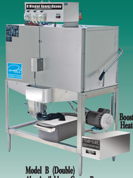
Model B (Double) Also Available as Corner B

Is your Low Temp dishmachine lacking an adequate supply of hot water to assure proper sanitation is taking place? No room for 220V in the electrical panel? We have the answer - "CMA TEMP-SURE HOT WATER ASSURANCE". Rather than replace your existing water heater with something larger and more expensive, add the "TEMP-SURE HOT WATER ASSURANCE" booster heater to your machine. The "TEMP-SURE HOT WATER ASSURANCE" is placed next to the dishmachine, not requiring any of your valuable kitchen space. The "TEMP-SURE HOT WATER ASSURANCE" provides an additional 25 degrees of temperature rise to your incoming dishmachine water supply.