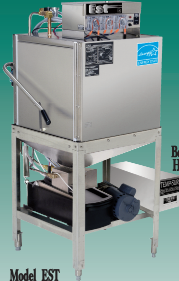
Model EST Also Available as Straight or Corner