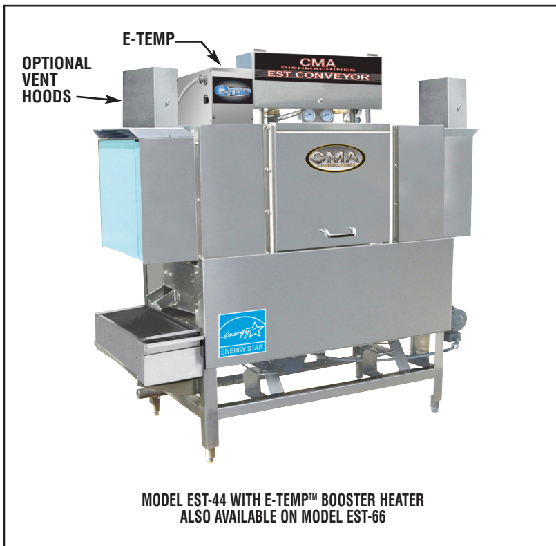
MODEL EST-44 WITH E-TEMP™ BOOSTER HEATER ALSO AVAILABLE ON MODEL EST-66