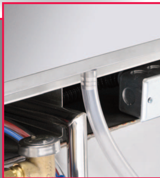
Back view of drain board showing drain hose

CMA now offers an optional “drain board” that fits all undercounter dishmachines. If a dish rack of wet dishes is placed on top of the machine, the water from the dishes will drain out the back of the drain board. The drain board is supplied with a 6 foot drain hose and with a way to secure the unit to the top of the machine. The “drain board” option offers a more sanitary containment of residue from wet dishes, reduces wet floor conditions and protects control switches from water run-off.