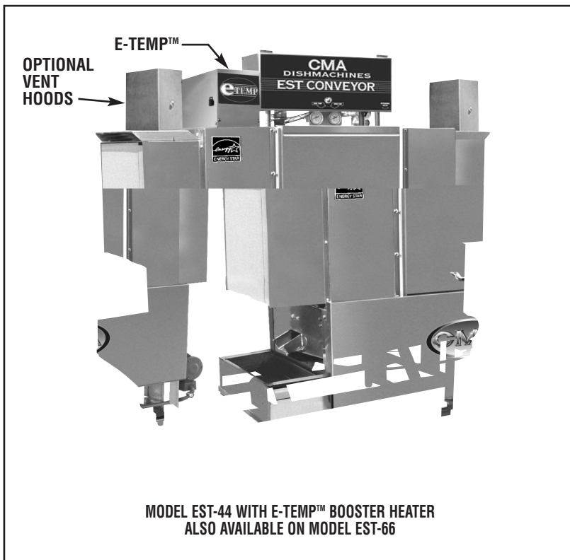
MODEL EST-44 WITH E-TEMP™ BOOSTER HEATER ALSO AVAILABLE ON MODEL EST-66