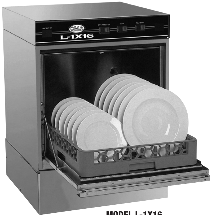
MODEL L-1X16 Door Opening 16" Legs not included

Chemical Sanitizing Undercounter Dishwasher