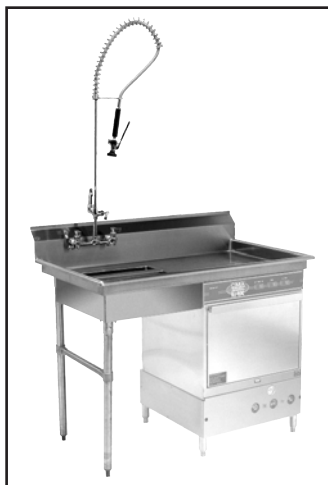
Optional dishtable and Pre-wash.