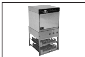
The optional Universal Pedestal has a storage feature for spare dishracks, with the ability to store two empty dishracks beneath the machine. 15-1/4"H X 24"W X 25-1/4"D.