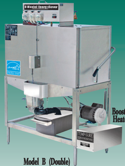
Model B (Double) Also Available as Corner B