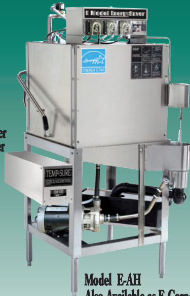
Model E-AH Also Available as E-Corner