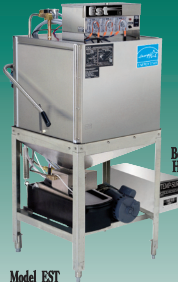
Model EST Also Available as Straight or Corner